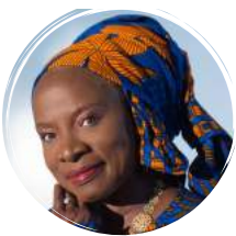
Angélique Kidjo Founder