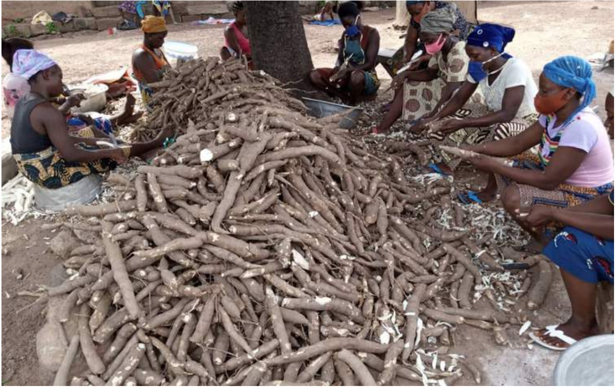
Young women from the circle buying cassava while peeling cassava