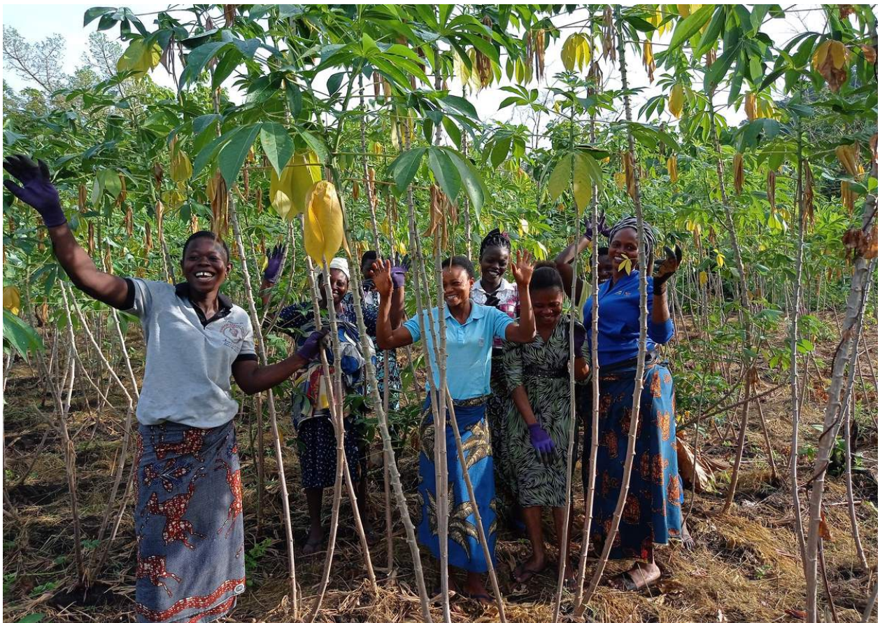
Young women from the Circle that grows cassava and sells it to another Circle

This cooperation not only diversifies supply chains but also increases the ability to obtain quality, locally made products at market price and ultimately enhance the overall sustainability of the Business Circles.