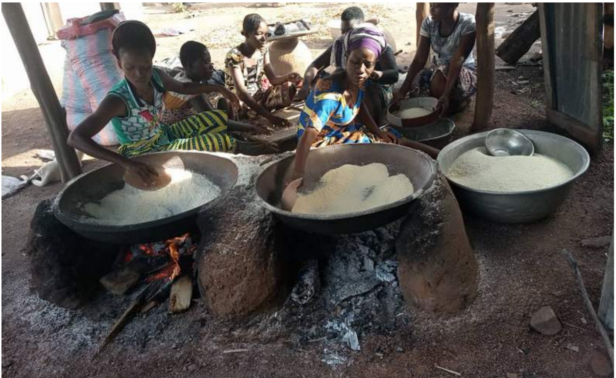
Making cassava flour after the peeling process and others